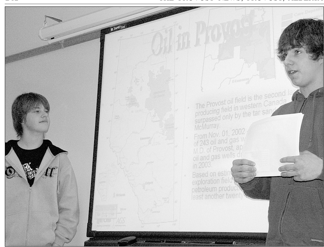
Provost Public School students presented a slide show and video for their counterparts in Corbin High School at Corbin, Kentucky.