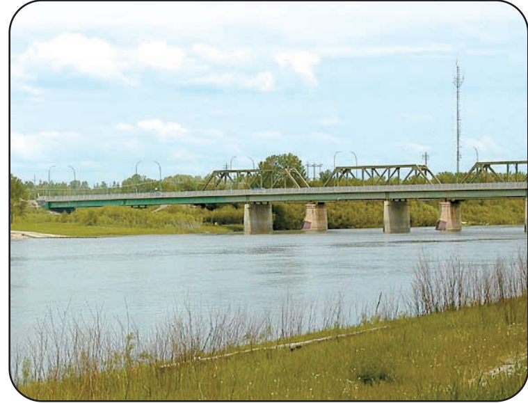
A shot of the Bignell Bridge, the only connection from The Pas, to its neighbouring community Opaskwayak Cree Nation. It is also one of two crossings of the Saskatchewan River in the entire province of Manitoba.