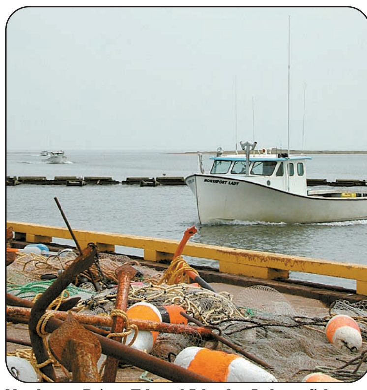
Northport, Prince Edward Island— Lobster fishermen return to the wharf in Northport, Prince Edward Island after a day's fishing.